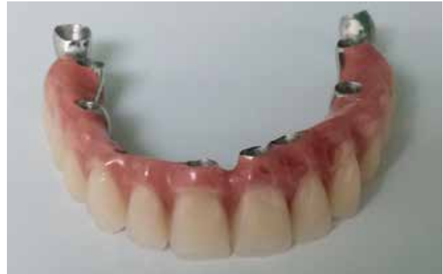
Fig. 6: Finished metal-to-plastic bridge before the cementation. The bridge contains teeth from 6-6 and distally two technical abutments