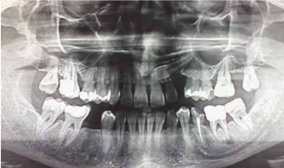
Fig. 1: Pro-operative panoramic overview picture showing generalized bone loss and profound periodontal involvement around many teeth. The upper left canine is horizontally retained and impacted. Cranial to this tooth the residual bone height including the cortical of the nose is approximately 3 mm.

Technique: After a thorough intra-oral disinfection (using Betadine 5%) all teeth were removed in local anaesthesia. Tooth 23 was impacted on the palatal side of the maxillary crest, i.e. palatal to the roots of 21, 22. Hence a small flap had to be raised both towards the palatal and the vestibular side in order to access this area and to access the tip of the root of this tooth. The crestal cortical was removed over the crown. Then the crown of this canine was sectioned off its root and removed. After this the root is removed in one piece by chiselling it from the vestibular side into the direction of the void area left by the already removed crown of the canine.