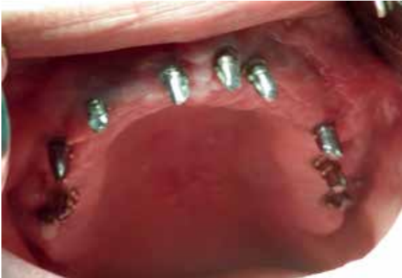
Fig. 5: Clinical view of healed mucosa in the upper jaw on the 5th post-operative day; at this stage of the treatment the patient had already been using the long-term temporary bridge for 2 days. The bridge was just clicked in, without cement, and the patient was advised not to eat sticky food. Note the excellent healing of the soft tissues after daily cleaning with Betadine Solution (5%).