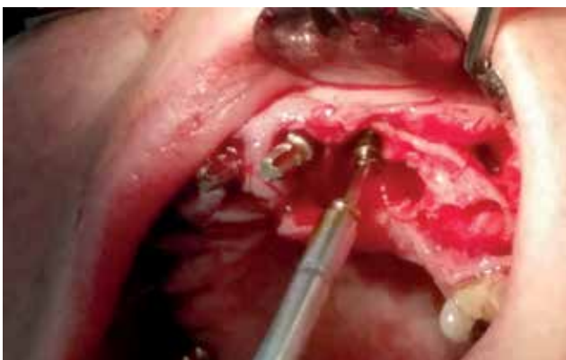
Fig. 3: After preparing a 2 mm diameter drill hole through the bony floor of the nose, 2 BCS implants are inserted into the osteotomy site of the upper left canine. The defect was then filled with «Hemospon» collagen sponge.

All flaps were tightly closed with 3.0 silk suture and for local disinfection sufficient rinsing with Betadine® 5% solution was used. The whole treatment was performed without systemic antibiotics coverage, in accordance with the wishes of the patient.